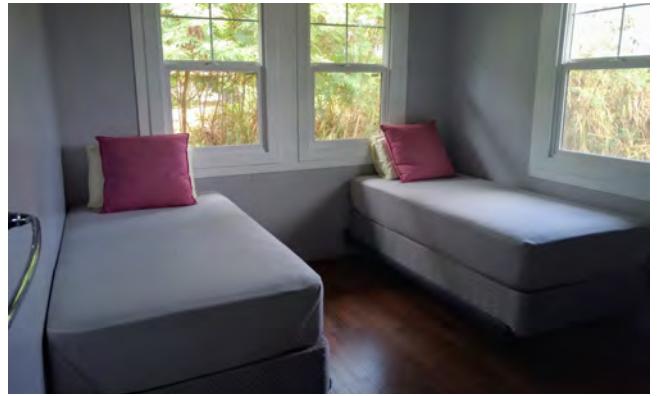
One of the girls' bedrooms at COYSA. COYSA hoped they would be serving the youth last September.