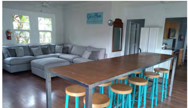
The commons area in the girls' COYSA house. There is a separate boys' house and another administrative house on the property.