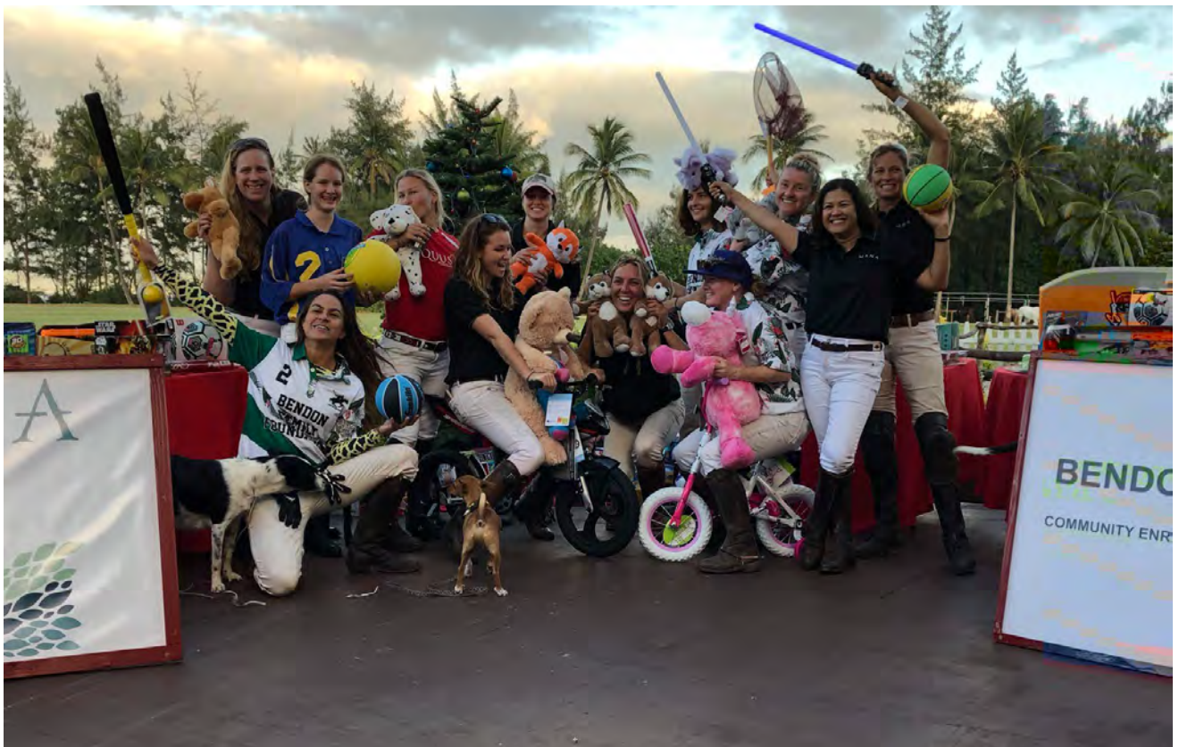
Operation: Toy Box Event- MAHALO from HAWAII POLO to our sponsors: Toe Sandals, Mana Wines, Bendon Family Foundation, Feed Trough, Haleiwa Joes, Livestock Tavern, Little War Horse, Pachulah, Botori, Exceptional Equestrian, La Christina-Hale o Polo, Equus Hotel, Hawaii Polo Club, North Shore News, Ladies of the Waimanalo Polo Club