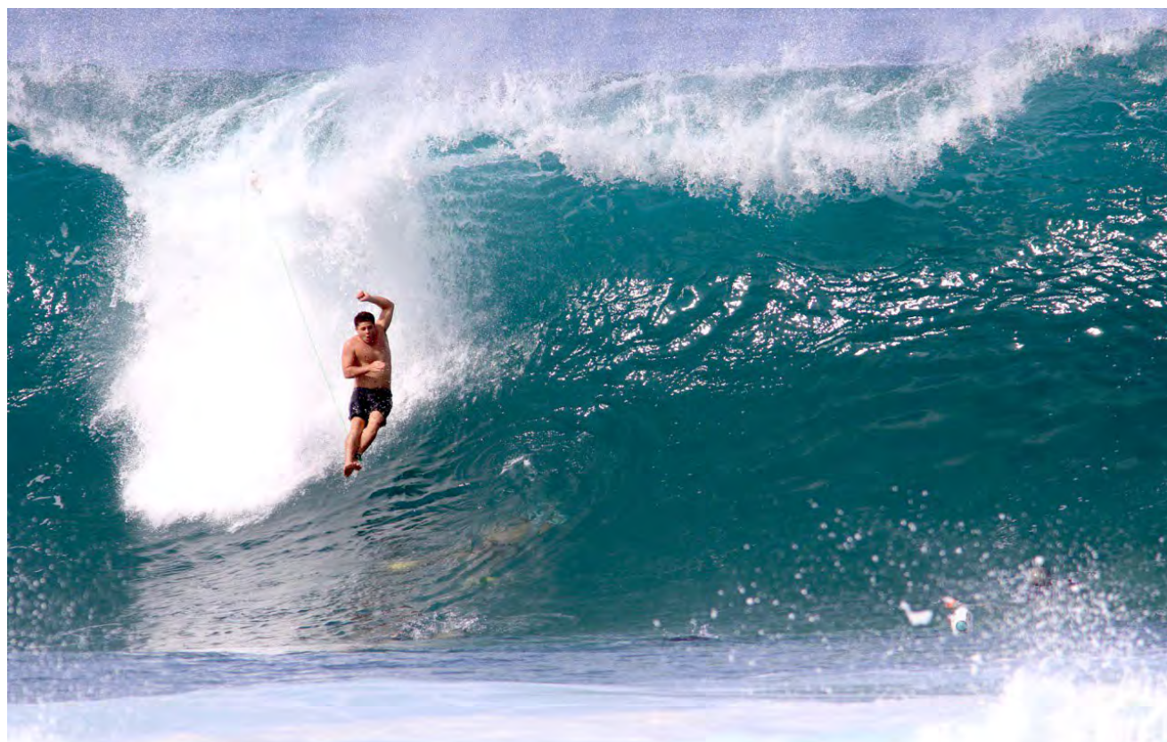
You gotta land perfectly at the Pipe! Rider unknown.

March can be a great time of year for Pipeline to be epic. It can also be a stormy, sand built up or a wash out. Lets hope March 21 through April 3rd will have three days of perfect surf for a mixed discipline surfing event. The "Pipeline Open" I am calling it. The event includes Women's shortboarding, Women's bodyboarding, Men's Bodyboarding and a full day of Bodysurfing. Banzai Productions will be taking entries for the Women's short boarding event. Email banzaib@hawaii.rr.com for the entry or go to facebookwomenspipelinepro for a jpg download. Sponsors welcome!