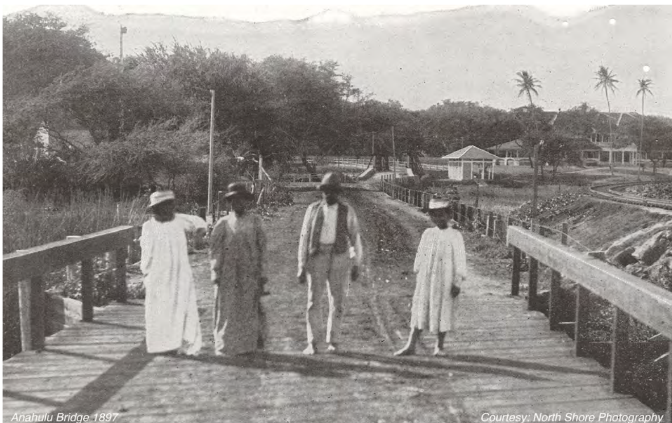
Anahulu Bridge 1897

We accept everyone regardless of ability to pay. Improving the quality of life for all. Imua!