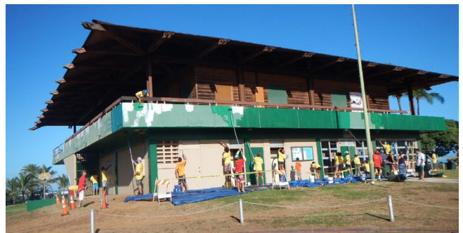
Community volunteers paint the John K. Kalili Surf Center at Ali'i Beach Park in 2014.