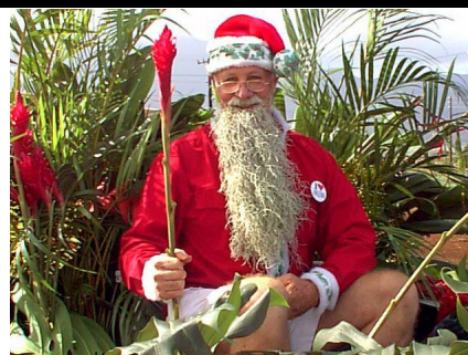
Santa at Hale'iwa Parade

NORTH SHORE NEWS December 6, 2017 VOLUME 34, NUMBER 23